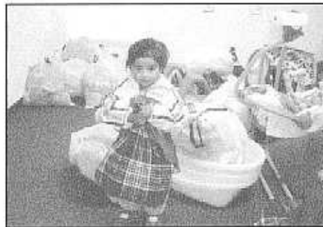
Navaho Indian girl with Stocking and Nursery toys for church behind her.