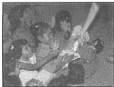
Orphan girls and boys receive Love-Lift gifts in India