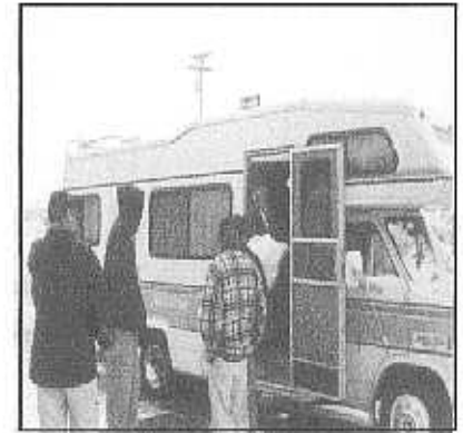
Navaho men unloading the Motor Home.

Altogether in 2004, during our operational year, Love-Lift Ministries volunteers were able to fill a record 7,172 Christmas-Stockings and Gift-Bags which were sent all over the world to help needy people of all ages. Among the completed deliveries in 2004 we were able to help fill a shipping container with 400 Stockings and Gift-Bags, many boxes of good used clothing and household items, and 30 layettes for newborn babies going to Tanzania, Africa. These items sent to Tanzania, were delivered to a pastor who distributed them to several small churches whose mission is to minister to aids victims in their communities in the name of the Lord. We have also been able to send gifts to Kenya on two different occasions. And, we were able to send a variety of items to Ethiopia to bless 100 babies in an orphanage caring for aids babies.