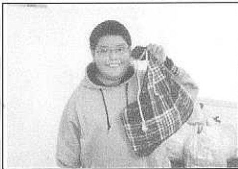
Navaho boy in Yatahey, NM

Most of our deliveries are completed by other volunteers, but this last Thanksgiving we were privileged to travel the more than 700 miles to the reservation to see for ourselves the harsh conditions which these Christian Navaho people undergo in their homeland. And we were able to receive the thank you's and deep gratitude of the people you helped in the name of the Lord. While we were on the reservation the temperatures reached ten degrees below zero as the snow covered the land with freezing beauty. The bags of good used warm clothing we were able to gather up and deliver were sincerely appreciated. We visited Indian homes where the only heat was provided from wood burning stoves, and where no running water was available to the homes. Thank you Love-Lift supporters for your part in reaching out with Christian love to these forgotten people - those loved by the Lord, as you and I are loved by the Lord.