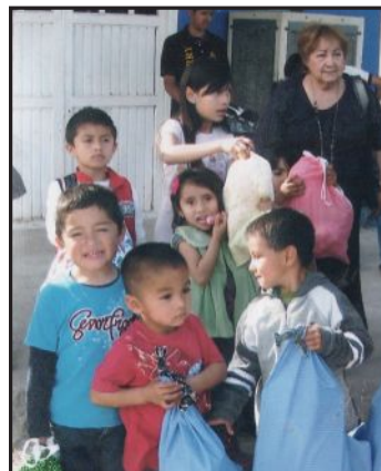
God Bless the little children