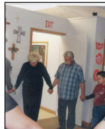
Circle of Prayer