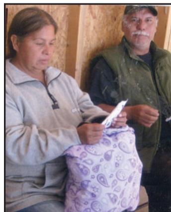
This bag holds 18 items