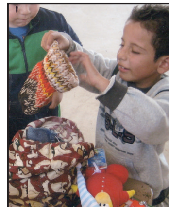
Wow! A warm Hat!