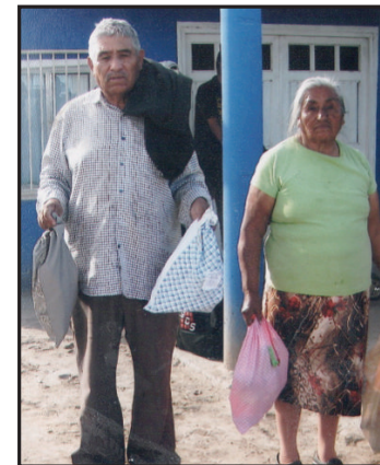
2 of 500 People helped on each load