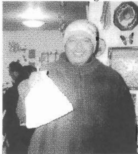
Young American Indian receives gift a bag.

White Eagles Christian Academy ( www.whiteeaglechristianacademy.com ) is an oasis of opportunity and hope in this desolate place. Here selected young American Indian students are given a quality general education, including computer and media production skills, while also learning Christian values by experiencing them. The plan is to develop young Christian leaders who have a desire to serve their people in the Name of the Lord so that future generations