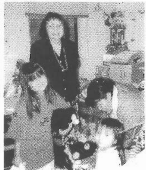
This Navaho family received your gifts.

Now that Love-Lift Ministries is an independent, nonprofit corporation, and faith based ministry with our own facility our needs for financial help, and volunteer labor are greater now than ever. Our monthly financial needs include two major areas: The rent for our Headquarters facility is $1,820.00. Add to this the cost of utilities. Our monthly budget also includes $1,500.00 used for purchasing the inventory items needed for our volunteers to fill an average of 450 gift-bags every month. We are careful in making purchases of items at the lowest cost possible. Our regular and faithful workshop volunteers are few in numbers. More volunteers are urgently needed. You, or your organization, are urged to call to find out more about how and when you can volunteer to work with us. Ask how you can arrange to visit our facility, or ask to arrange for a speaking and display presentation of Love-Lift Ministries at your church, school, or organization. We need you!