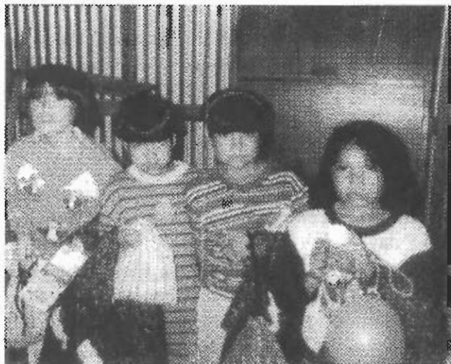
Girls at the Black Buffalo Orphanage receive special gift bags.

Last year, amazingly, we touched over 10,000 people in need with our four-part ministry program: 1.) The Christmas Stocking and Gift-Bag Program , which has two parts: a.) The annual Christmas Love-Lift, beginning early in the Fall, in which participating churches and other organizations fill stockings and bags. b.) The all year long program in which faithful volunteers at our warehouse facility fill stockings and bags from our warehouse inventory every week of the year. Our warehouse inventory is purchased with your financial contributions, or material donations.